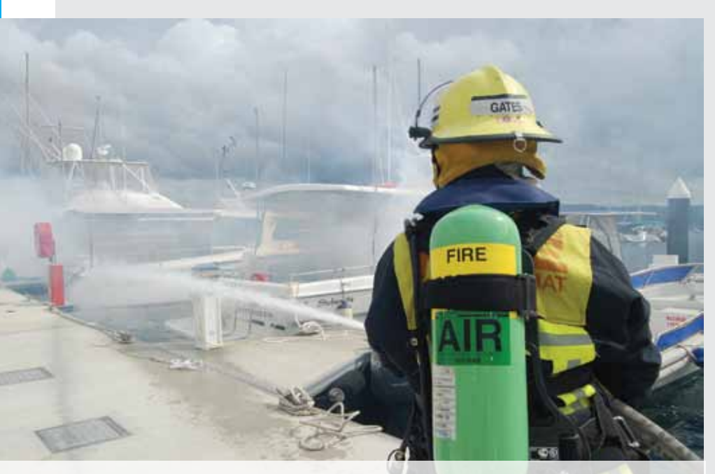
A FRNSW firefighter "extinguishes" the boat fire

Firefighters raced to the Royal Motor Yacht Club at Pittwater as thick blue and orange smoke poured from valuable yachts. Three motorboats were apparently engulfed in flames, with one burning through its moorings and drifting out into the bay, potentially creating havoc for other craft. Meanwhile, marina staff were trapped at the end of one of the finger wharves.