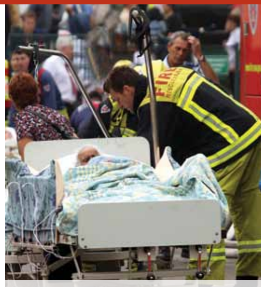
Quakers Hill Nursing Home fire

"While the collected data is still being analysed, observed data on the day showed the unsprinklered room achieved a maximum temperature at ceiling height of 1167°C and went to flashover in about 22 minutes," Superintendent Lewis said.