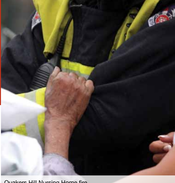
Quakers Hill Nursing Home fire