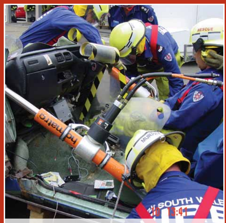
Firefighters demonstrate vehicle extrication skills

Senior and Qualified Firefighters who work at rescue stations will be able to sign up for a new Rescue Training Program from September this year.