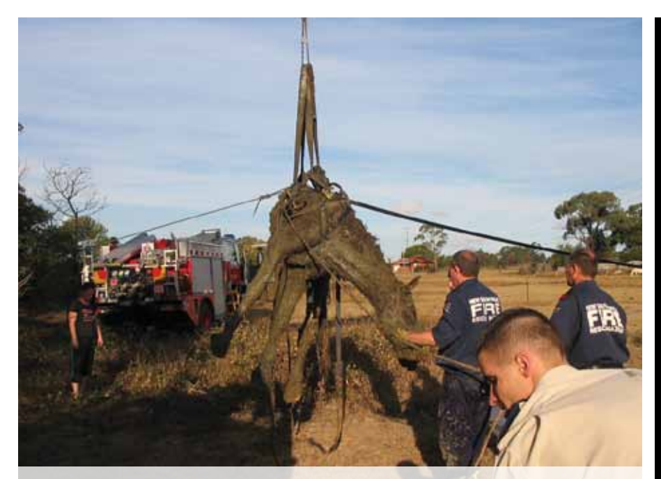
A high level of skill is required when conducting large animal rescues

getting stuck in mud all over the countryside. For a month I responded with the team to lots of different rescues but the one that makes every Australian laugh was a call to 20 European carp fish in a puddle. I will say no more about that other than it was not a joke.