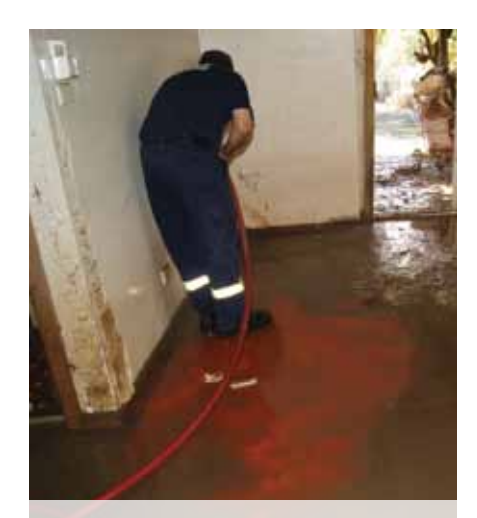
FRNSW mop up after the floods

Upstream, the town of Lockhart was inundated by floodwaters in the early hours of Sunday 4 March. The fire station and 100 homes were impacted, so retained firefighters worked through the night moving local residents, and the truck and equipment from the fire station, to higher ground. Once the flood waters receded, FRNSW crews from Lockhart, Turvey Park and Wagga Wagga worked with local RFS volunteers and the community to clean up the town.