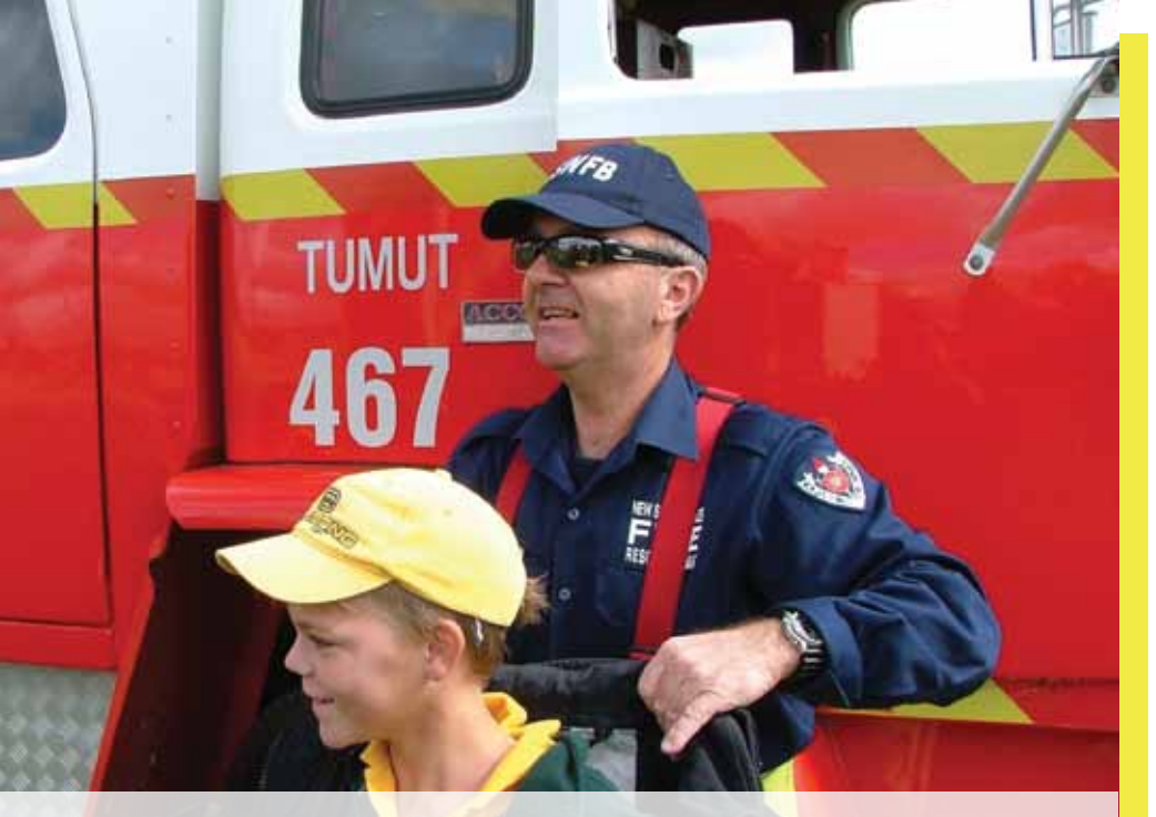
Tumut firefighters at a community education event

There are substantial potentially hazardous industries around Tumut including the paper mill (set on 1100ha), silos and logging trucks. Timber, building materials and cardboard are transported in and out of the district by road and firefighters respond to a significant number of truck incidents. "We attended three large protracted fires at the paper mill," said Captain Ivill. "These incidents are a great opportunity to learn as well as put our skills and training to good use. We are certainly becoming more proficient."