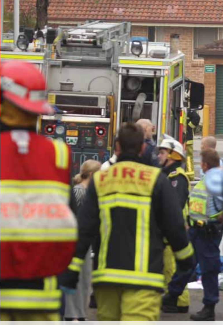
Quakers Hill Nursing Home fire

Ambulance paramedics set up a triage area on the front lawn and in the driveway, with many residents suffering severe smoke inhalation and, in some cases, burns as well. Paramedics conveyed those most seriously injured to hospital as quickly as possible.