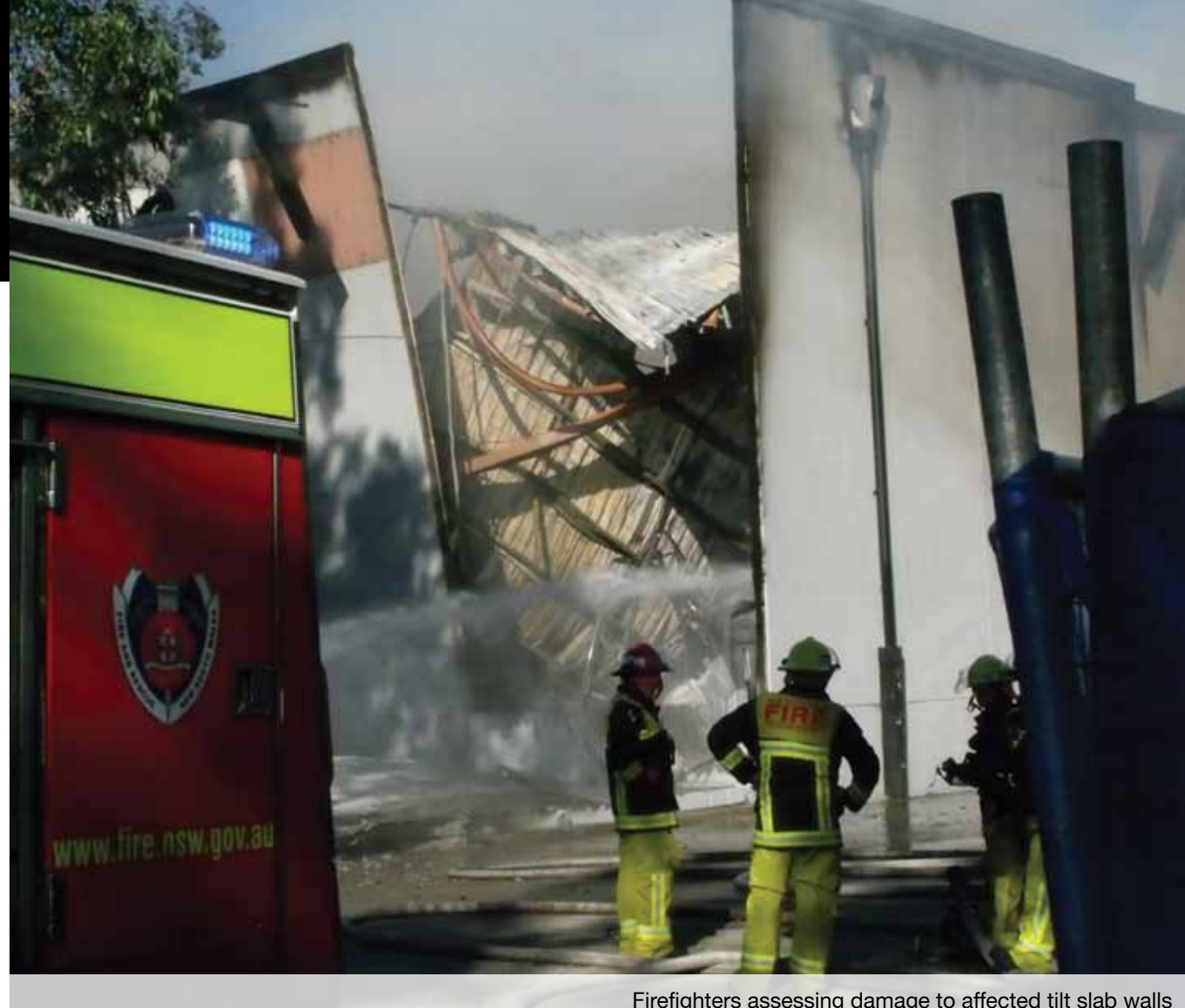
Firefighters assessing damage to affected tilt slab walls