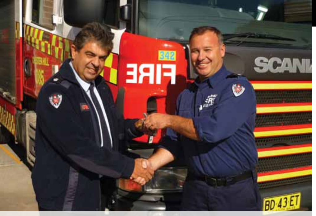
Chester Hill station becomes heavy hazmat