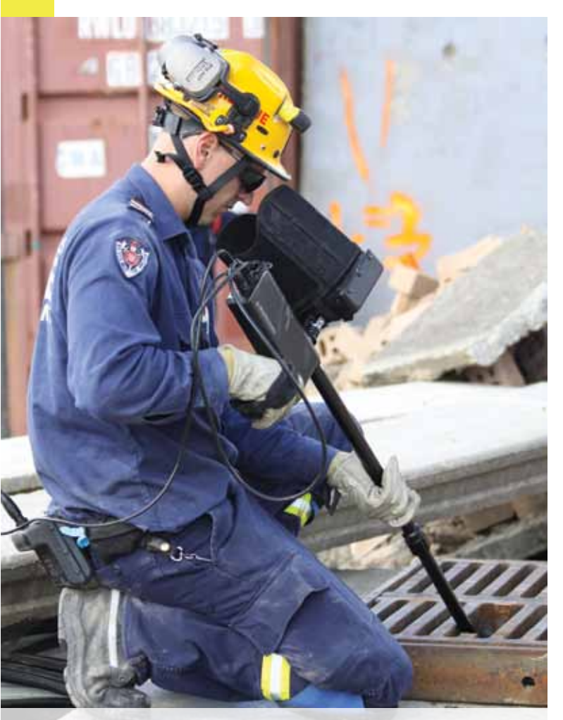
USAR officer using an Entry Link Camera

USAR 1 is a semitrailer fully loaded with urban search and rescue equipment and is based at Ingleburn Disaster Response and Rescue Education Centre. The semitrailer is one of seven USAR resources available for operational or training use in FRNSW. It carries equipment as ordinary as a garden spade, and equipment as specialised as the Entry Link Camera, the Delsar Life Detector and the Wohler Pipe Camera.