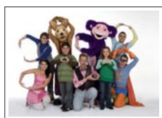
Hooley Dooley's 'Zero Zero Zero' song, words and actions