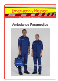
Flashcards x 12 types