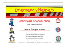
Certificate of Completion