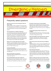
Frequently Asked Questions