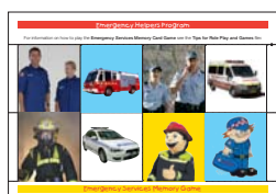
Memory card game