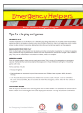
Tips for role play and games